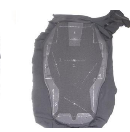
5C-02-1 - Back