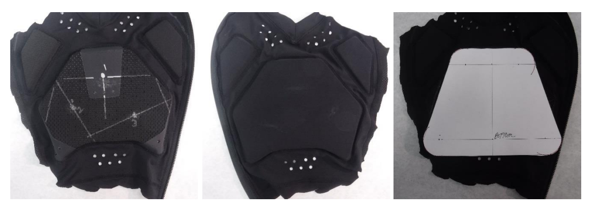
5D-1 - Chest